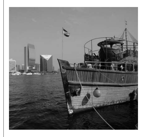
A traditional dhow

The ATB offers a range of travel services including travel insurance, conference bookings, incentive tours and car rentals, as well as the usual air travel and hotel reservations offered by most travel agents. The airport branch of the ATB operates a 24-hour call centre service as well as a 'Meet and Greet' service for passengers arriving at Abu Dhabi airport.